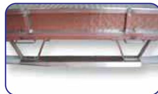
Stainless steel guide plates and 20 mm cestilene runner bases